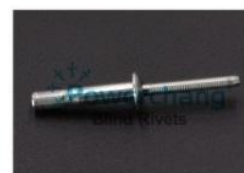
Mono-lock Dome Head