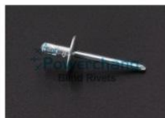
Uni-Grip Type Large Flange