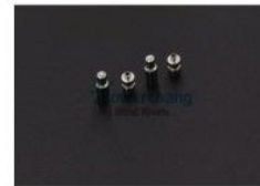
Small Circuit Breaker Parts