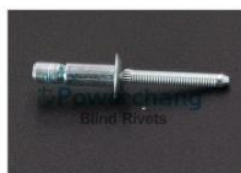
Now-lock Dome Head