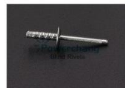
Multi-Grip Type Large Type