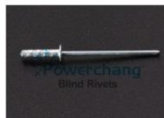
Multi-Grip Type CSK