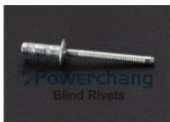
Uni-Grip Type Dome Head