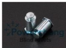
Galvanized Riveting Studs