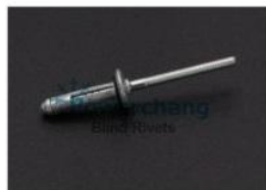
Dome Head Waterproofing