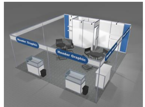
20' x 20'